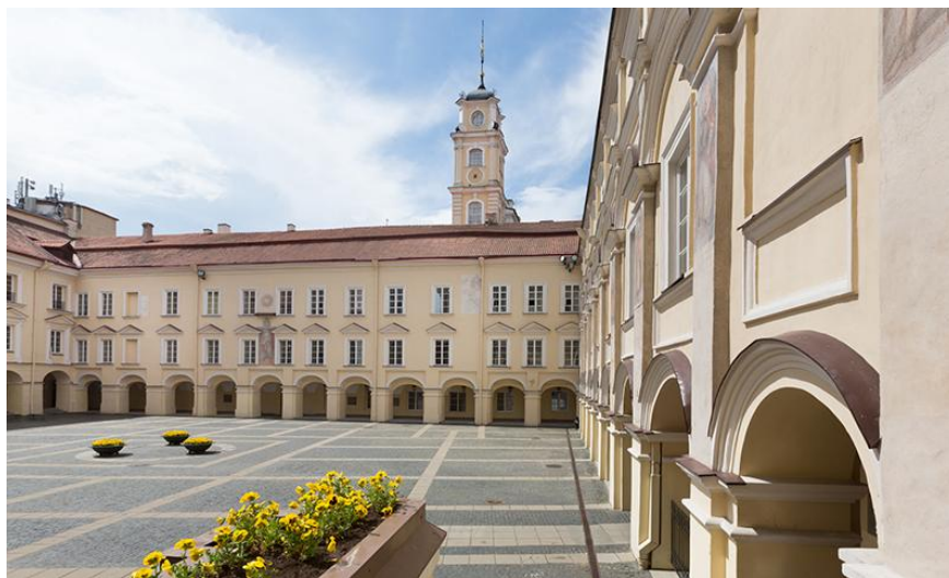
Grand courtyard of Vilnius University

The conference dinner will take place at Grey Restaurant , located in Vilnius Old Town at Pilies St. 2, next to the historic Vilnius University building complex. The dinner will offer an excellent opportunity for participants to socialize and network in a relaxed atmosphere.